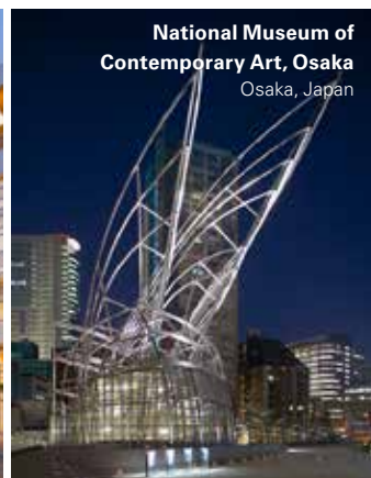
National Museum of Contemporary Art, Osaka Osaka, Japan