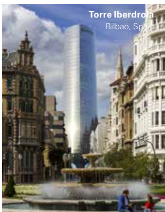
Torre Iberdrola Bilbao, Spain

2010 Merit Award – Salesforce Transit Center 2009 Building Type Honor Award – The Visionaire